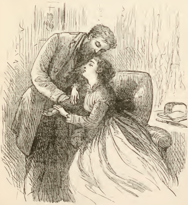
"ONE HAPPY MOMENT."

"Poor Christie, it's hard that you should go away